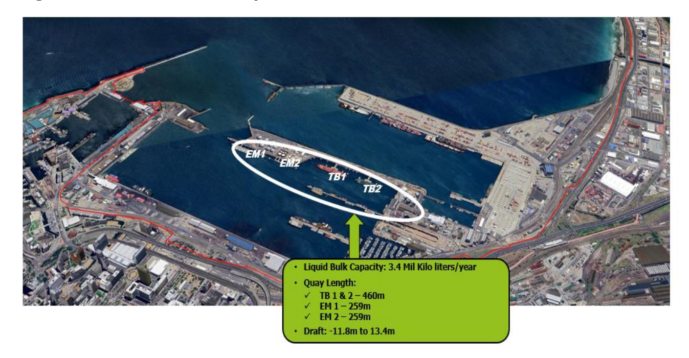
Figure 2. Aerial Overview of Liquid bulk Precinct